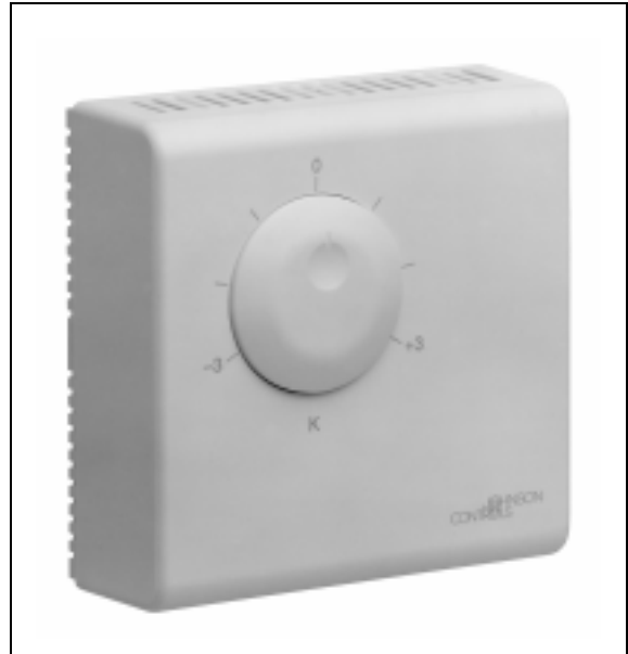
Figure 7: Flow Temperature Sensor