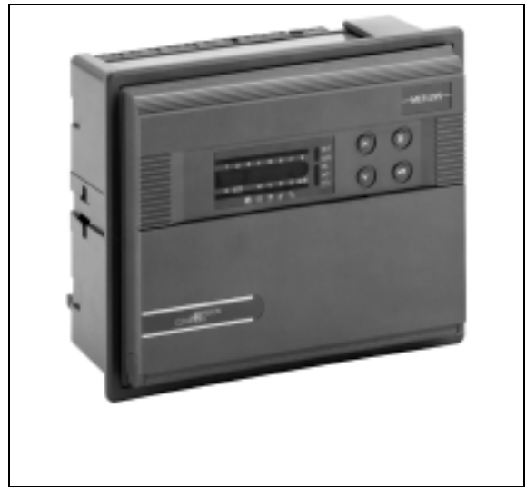
Figure 4: DX-912x With Panel Mounting Base