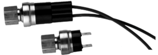
P100 pressure controls, automatic reset with wires (top) and automatic reset with 1/4" male quick-connectors (bottom).